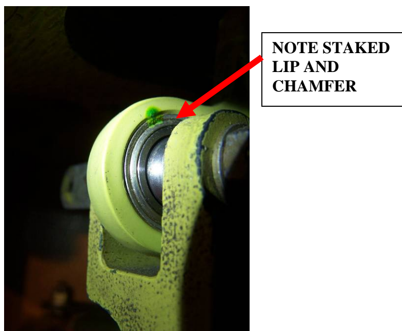
Figure 2: Example, Correctly Staked Roll Stake Bearing.