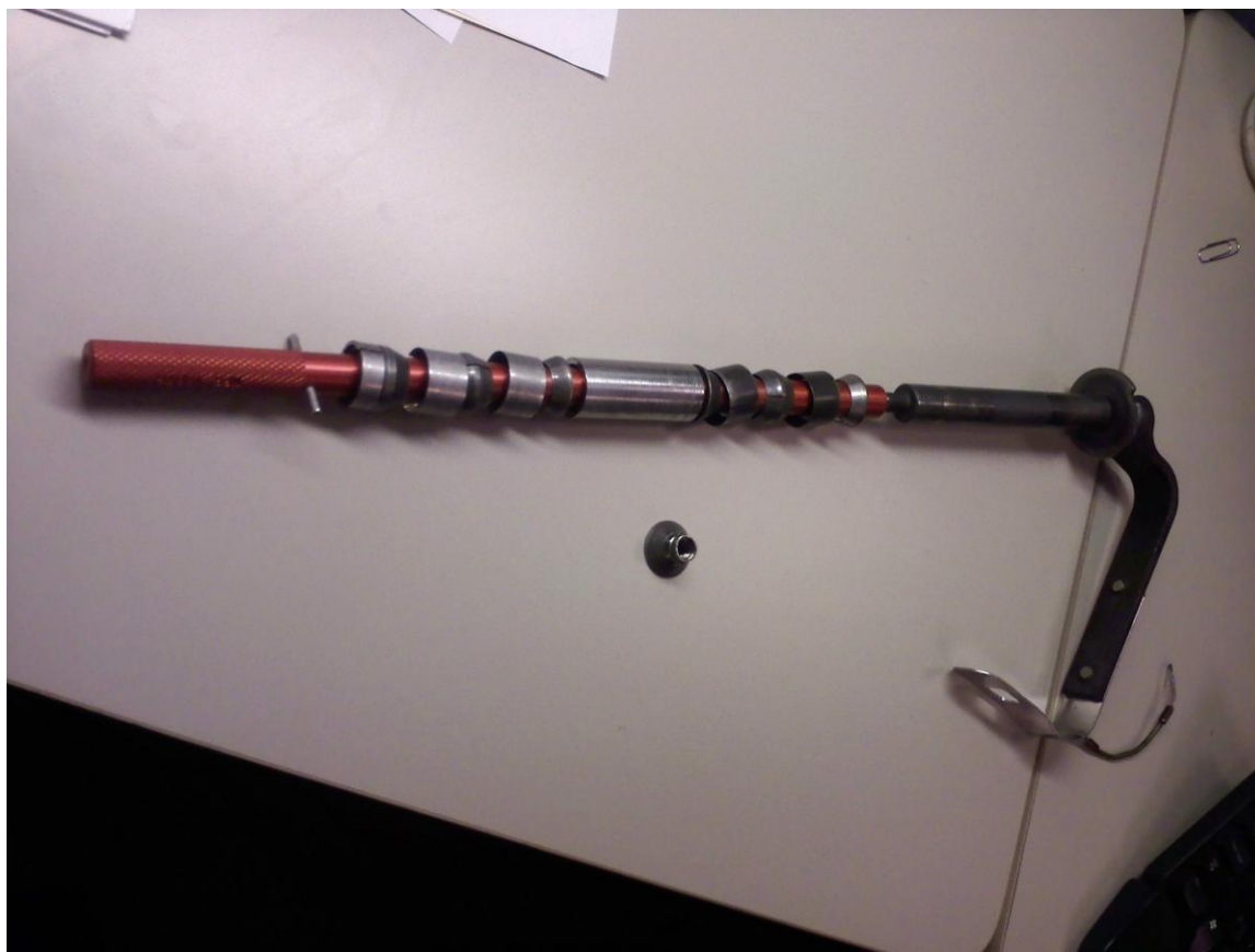
Figure 3: MR Expandable Bolt, PN 406-310-103-101, ready for inspection and cleaning.