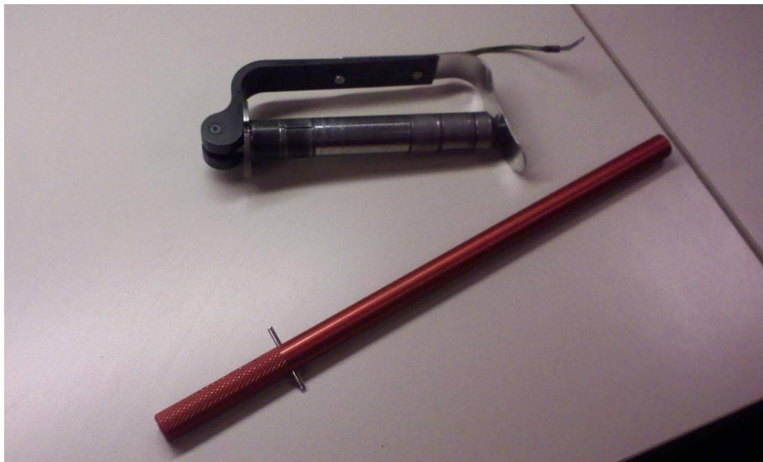
Figure 2: MR Blade Pin Cleaning Tool, NSN 5120-01-475-9901, PN 156058DBPCT, and MR Expandable Bolt, PN 406-310-103-101